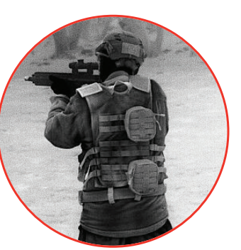
Trijicon Electro Optics 12µm, 640x480 @ 60Hz