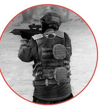
Trilicon Electro Optics 12µm, 640x480 @ 60Hz